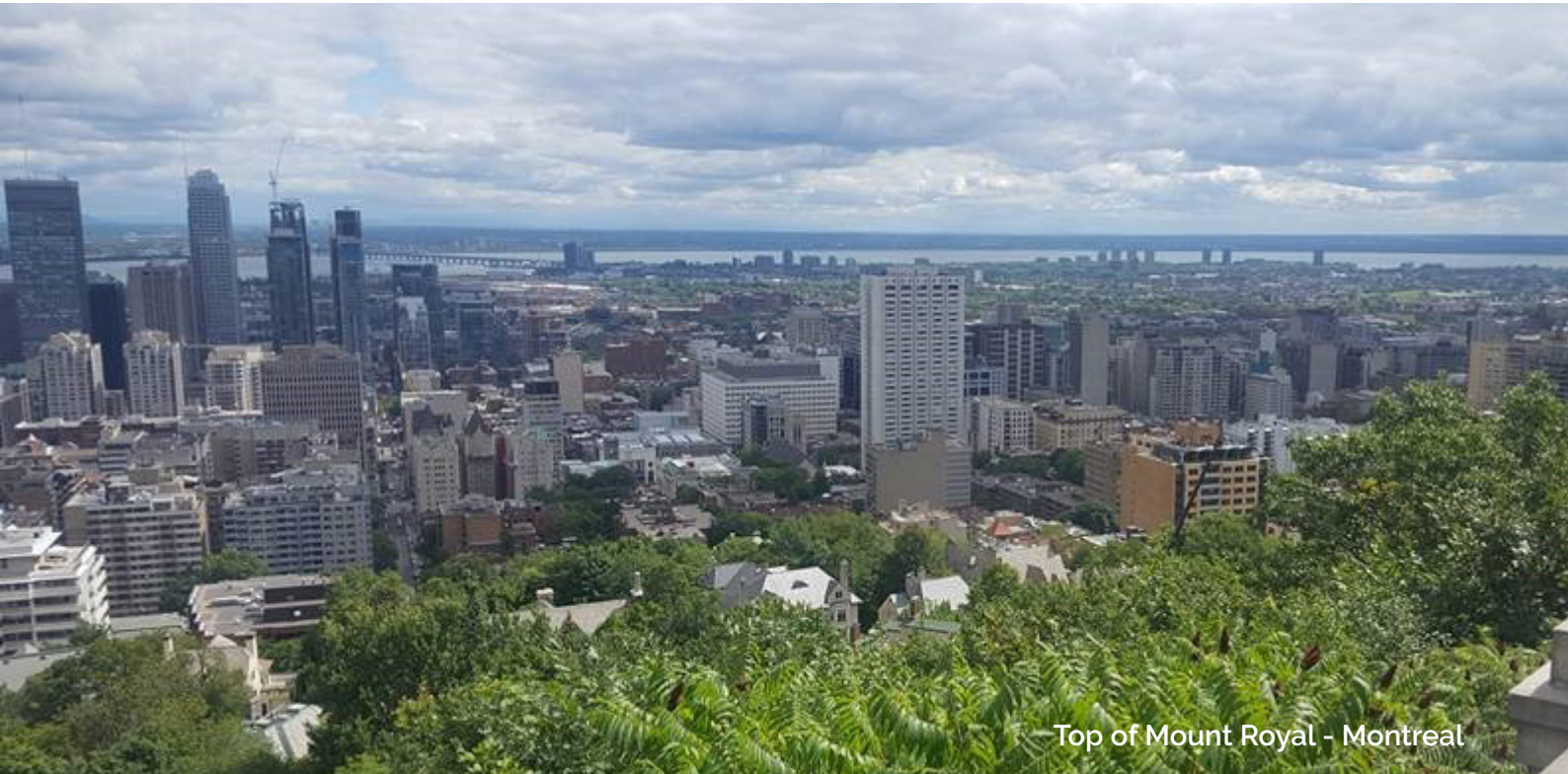
Top of Mount Royal - Montreal

As it is now getting colder with winter approaching (temperatures can reach as low as -30!) there is the opportunity to go skiing in Mont Tremblant which is supposed to be amazing and is approximately 40 minutes' drive away which makes it very convenient for weekends.