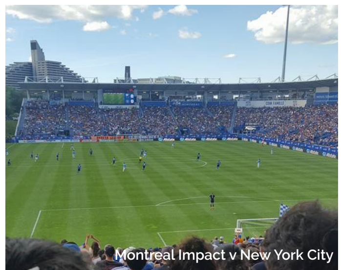
Montreal Impact v New York City