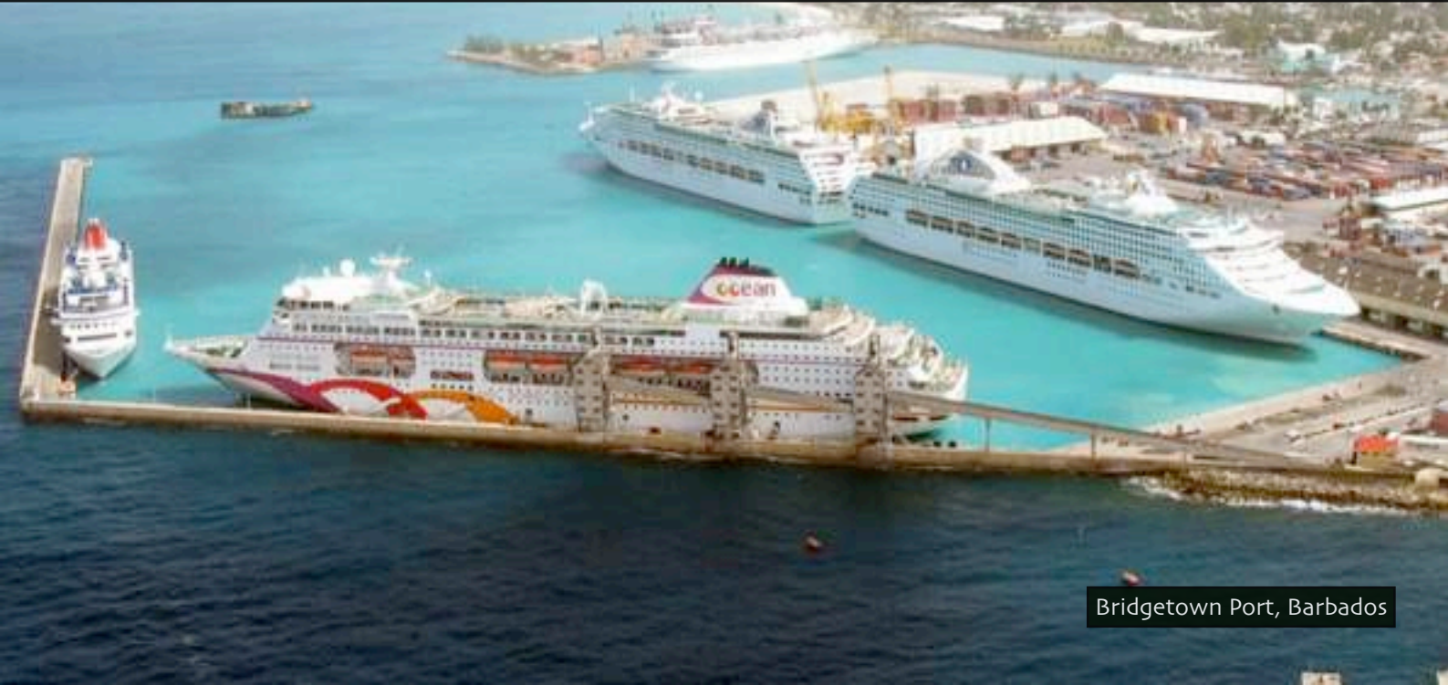
Bridgetown Port, Barbados