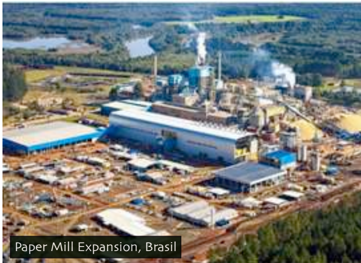
Paper Mill Expansion, Brasil