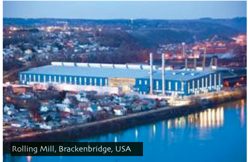
Rolling Mill, Brackenbridge, USA