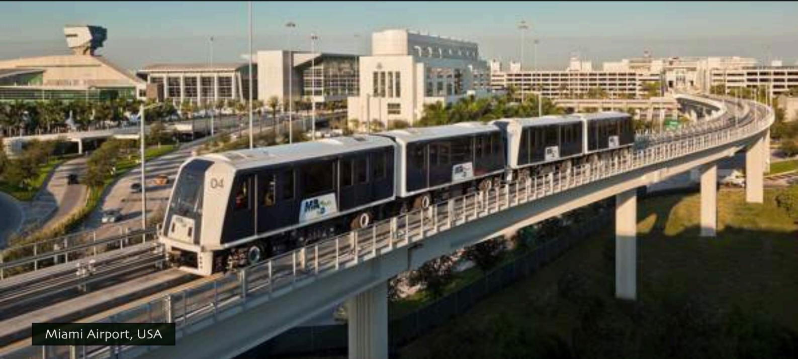
Miami Airport, USA